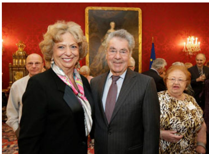
Reception hosted by Federal President Fischer

Peru, Australia, Great Britain, Italy, and Switzerland. The visit was supported by the City of Vienna , the Federal Chancellery and the Vienna Insurance Group .