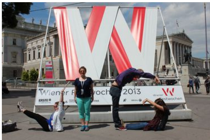
There was also lots of fun – during the visit to Vienna of the ten students, seen here in front of the Parliament building

in cooperation with Hillel Canada "Celebrate Jewish Life and Culture in Vienna" was the motto of a joint venture between the Jewish Welcome Service and Hillel Canada that was continued in 2013 due to its tremendous success. The Jewish Welcome Service invited ten students to visit Vienna for several days from May 21-29, 2013 . The aim of the programme: Learning about/presenting Vienna as a modern, cosmopolitan European city as well as a highly involved Jewish community.