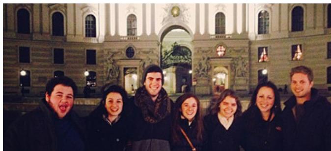
Hopkins Hillel travels to Vienna on break.