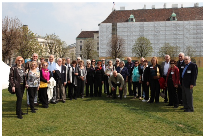
The group of expelled Jewish citizens invited by the Jewish Welcome Service to Vienna in April visits the project " Sowing the Seeds " at Heldenplatz