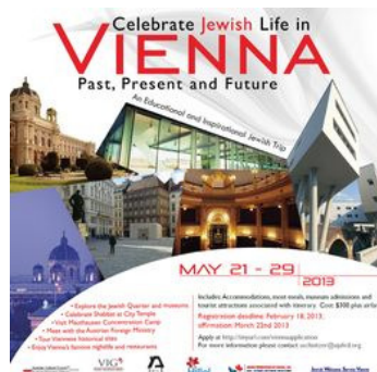
The Jewish Welcome Service