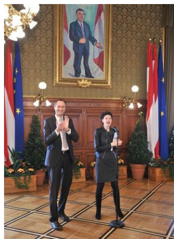
In April 2013 the Jewish Welcome Service invited a group of expelled Jewish citizens to a one-week visit to Vienna .

"Celebrate Jewish Life and Culture in Vienna" is the motto of a joint venture between the Jewish Welcome Service , Hillel Toronto and the United Israel Appeal Federations of Canada (UIAFED) that will be continued in 2013 due to its tremendous success. The Jewish Welcome Service will invite ten students to visit Vienna for several days from May 21-29, 2013 . The aim of the programme: Learning about/presenting Vienna as a modern, cosmopolitan European city as well as a highly involved Jewish community.