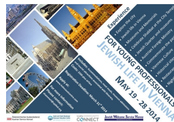
Poster for the Vienna study trip for Young Professionals in cooperation with the Holocaust Education Centre Toronto in May 2014.